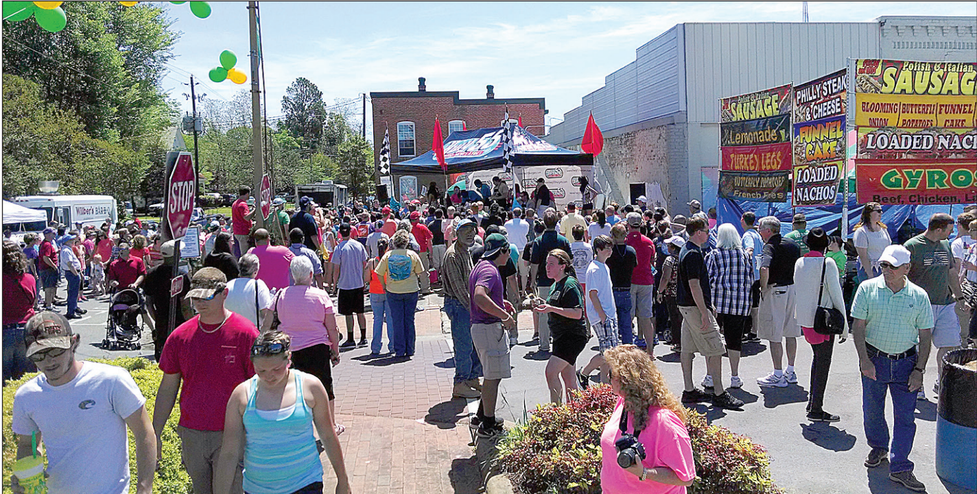
PICKLE FESTIVAL 2015 - The 29th annual North Carolina Pickle Festival comes to Mount Olive this weekend, and this year's event is expected to be the biggest ever, once again with a crowd of 50,000 or more people over the course of the day Saturday. See the pull-out section inside for more information.